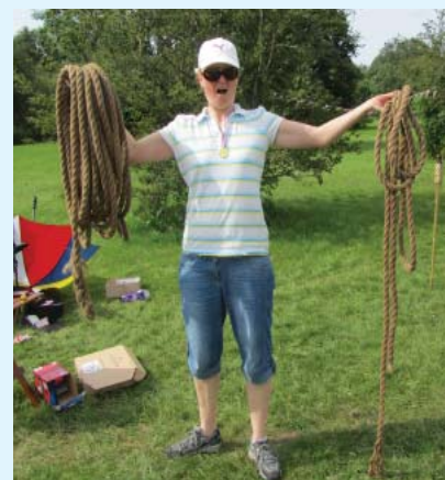
Did anyone win the tug of war? Frayed knot!!!!