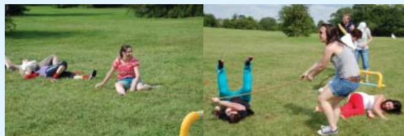
Not that hard!!!!