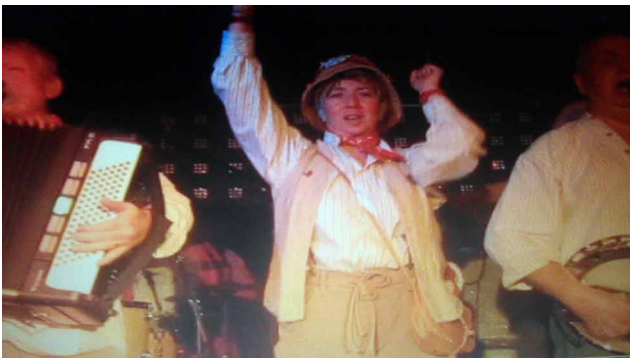
The New Wurzel

Then there was our Christmas night out with the legends The Wurzles, oh what a night we had, fun was had by all (ish), lots of cider drunk up, lots of singing and dancing!! As a treat they used this night to introduce a new member to the band!