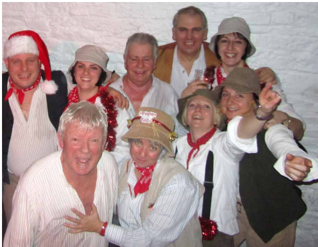
All the Wurzels

Dressing up was on the cards for a few of us, costumes were so good its hard to tell where BAC end and the Wurzels start!!!